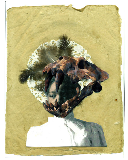
Krista Franklin, We Wear the Mask VIII , Mixed media collage on handmade paper, 2014, Image courtesy of the artist

http://www.kristafranklin.com/ http://www.kristafranklin.com/works/ http://www.kristafranklin.com/interviews/ http://www.kristafranklin.com/press/ https://linktr.ee/therealkristaf https://artsforillinois.org/posts/featured-artist-krista-franklin-summer2020