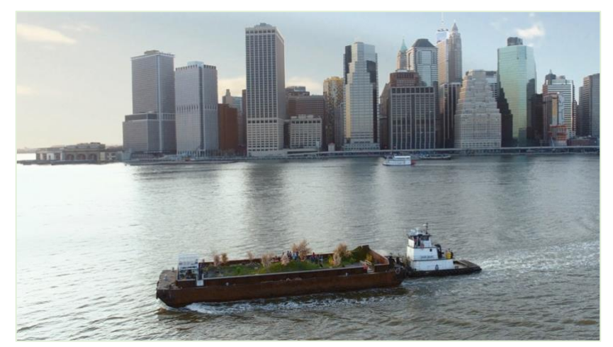
Swale, 2017

In collaboration with the Brooklyn Public Library, More Art, NYC Public Parks, Prospect Park Alliance, "A <u>Year of Public Water</u> examines the complex history of NYC's drinking watershed, bringing attention to the often unseen labor that people, along with the broader ecological community, undertake to care for water. As the U.S. experiences a heightened health, economic, environmental, and water poverty crisis, millions of people face obstacles to access safe, clean running water daily. Agricultural runoff, byproducts of disinfection agents, as well as aging infrastructure like lead pipes have contaminated drinking water, especially in BIPOC and low-income communities. Addressing environmental, health, and economic conditions in and around New York City's watershed and public water system is a vital precondition for the creation of a more just present and future for upstream and downstream New Yorkers. A Year of Public Water is an invitation to examine our relationship to water in order to cobuild more equitable partnerships between downstream water-receiving communities and upstream water-source communities. <u>public-water.com</u>"