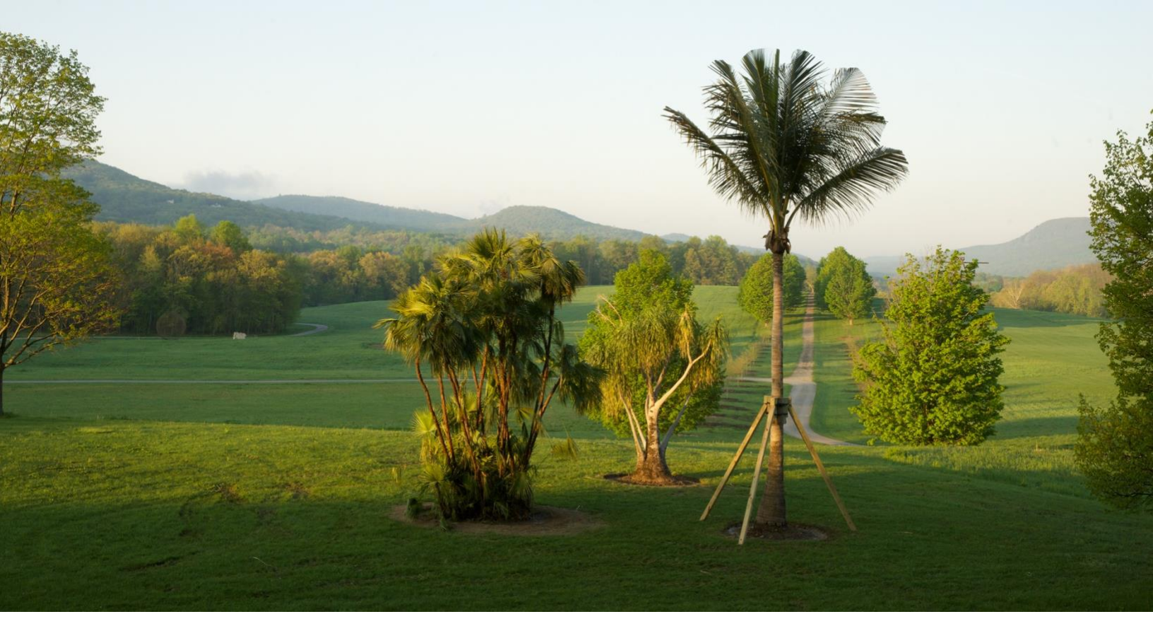
Mary Mattingly, Along the Lines of Displacement: A Tropical Food Forest, 2018