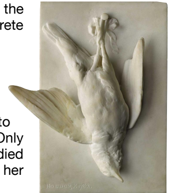
Houdon, The Dead Thrush , 1782

I vividly remember one chilled October morning when I found two dead pine warblers and a badly injured hermit thrush who had struck the glass. I wrapped the warblers in white napkins and buried them behind the art building. The thrush was stunned, so I took her up the street to Willowbrook Wildlife Center, where she was taken in with great care. Only later, upon calling the center did I learn that this particular bird had died from the injuries to her head and neck. A swell of grief washed over me; her death served as a stark reminder of the transience of all lives.