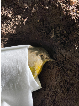
David Ouellete, Wrapped Warbler , 2018

Since 1970, North America has lost 29% of its bird population, due largely to human modification of the environment. Habitat loss is a primary culprit, but bird strikes with architecture or other manmade structures account for between 700 million and 1 billion birds deaths annually.